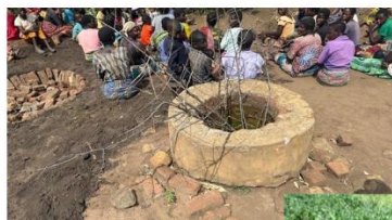
Their well before and after